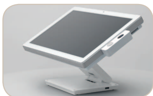
1. VESA mount solution, fits almost all flat systems